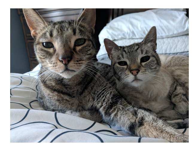
Lexi (white/grey) Lynx (brown/black)