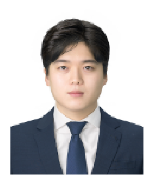
What is your name?

What are your hobbies? play badminton; travel; watch TV shows